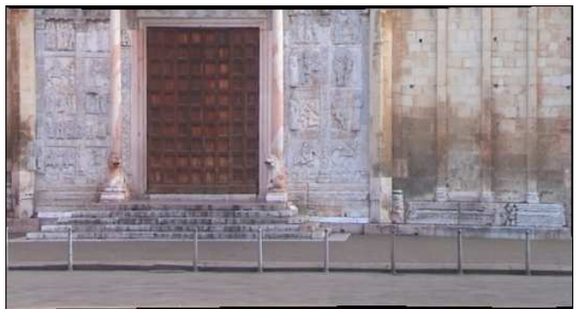
Fig. 3. Mosaics of the “Lorena” background, obtained after global registration.