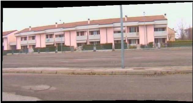
Fig. 5. Mosaic of the background for the “Arosa” sequence.