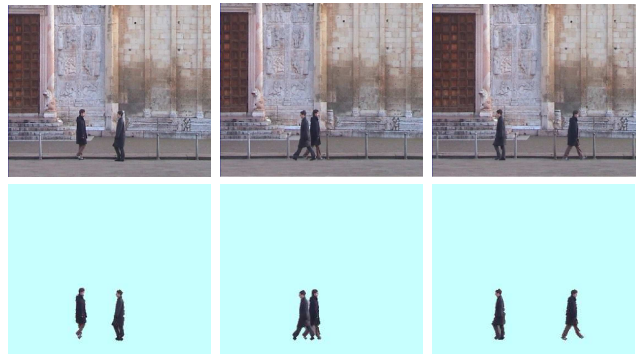
Fig. 2. Selected frames from the “Lorena” sequence (top) and the result of segmentation (bottom).

MovingRegions. The mosaic is encoded as a still image and MovingRegions are encoded separately. Therefore one needs to send the mosaic, the moving objects and the frame-to-mosaic homographies. The decoder pastes the MOs onto the mosaic and warps it back to produce the original sequence.