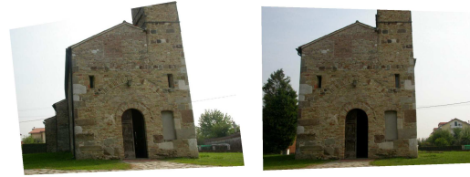
Figure 4: Rectified images used for the recovery of the front façade.

Construction of elevation maps. For the recovery of relief maps we developed a simplified version of a recent stereo algorithm based on gestalt principles [YK05]. While based on local methods, it can achieve good performance by employing large disparity neighbourhoods. The problem usually associated with large correlation windows are minimized by weighting the stereo cost function with a measure of similarity and proximity between candidate matches, thus mimicking the behaviour of stereo algorithms based on explicit segmentation. Candidate views for disparity estimation are selected by identifying those that both contain a large set of visible points from the considered surface. The views are first rectified, discarding during the process the couples