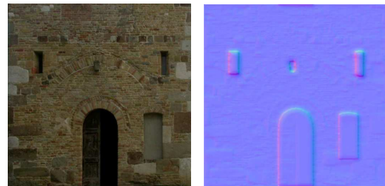
Figure 5: Color and normal textures automatically generated for the front of the church.

with excessive distortions. Conflicts is depth arising from different couples are resolved taking the median of the estimates. Once disparity has been obtained recovering bump, normal and displacement maps is straightforward; these data enables the simulation of fine geometry and the use of modern rendering algorithm such as [KTea01] and its more recent derivations. Since this scene description is a common standard in consumer rendering pipeline, our work can therefore potentially close the gap currently open between acquisition and visualization of urban environments.