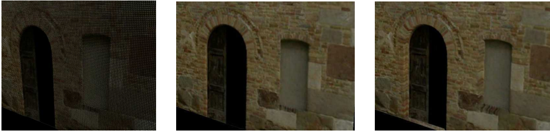
Figure 6: From left to right, the dense mesh generated from stereo matching, a single quad textured without fine geometry and the same quad with parallax mapping.

tinuity properties and its remarkable accuracy in modeling the perimetral walls are evident when projecting recovered features onto the ground plane (Fig. 3). The same pictures shows the planar surfaces, all correctly recovered using ten thousand different hypotheses in the primitive fitting.