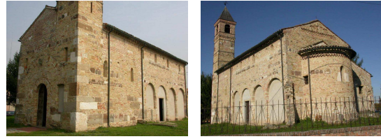
Figure 1: Two of the pictures from the dataset used in our experiments.

ages are connected into tracks, rejecting as inconsistent those tracks in which more than one keypoint converges.